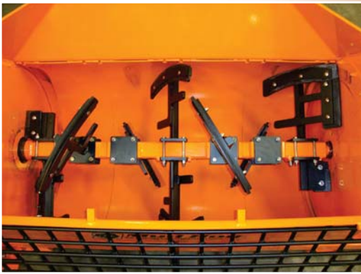
Vertical paddle design cuts through material for a homogeneous mix.