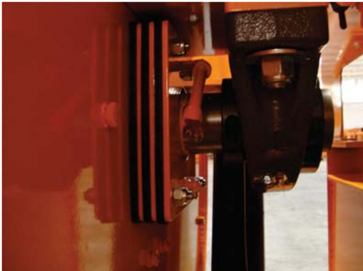
Bearing design keeps the seals 1 1/2" from bearings. In the event of a seal leakage, the bearings are not damaged.