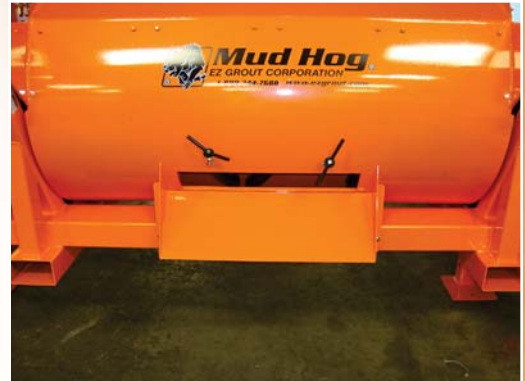
Custom modifications are available. We welcome any suggestions to help your operation.