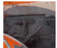
EZG's patented paddle design with 8 blades ensures uniform clog-free mixing in the remix hopper.