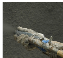
Ultra high-pressure piston pump consistently delivers 18 yards per hour