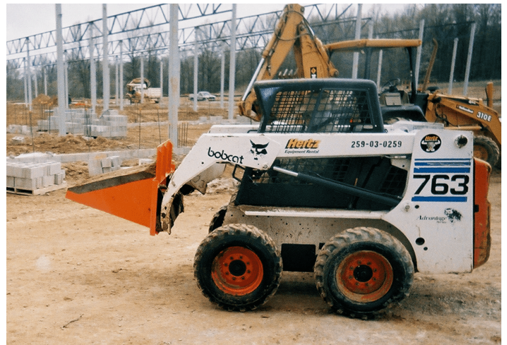
Versatile Mounting Options: Available with fork pockets or universal skid steer mount for easy integration into your existing setup.