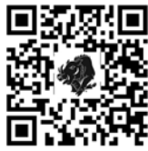
[ VIDEO ] BARBED WIRE

f in @ Love it? We want to hear from you.