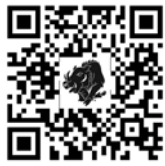
[ VIDEO ] WOVEN WIRE