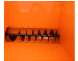
7.5-inch diameter flighted auger pushes material forward with ease.

f in @ Love it? We want to hear from you.