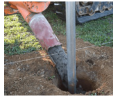
Designed to dispensing wet or dray materials with precision for resulting in less waste.