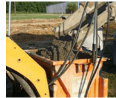
Efficiently transport material to hard to reach or confined areas.