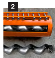
Rotor stator builds pressure in cavities for optimal delivery.