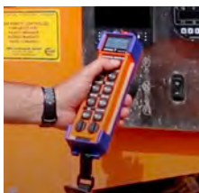
HP-20T4 Model optional wireless remote feature