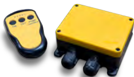
HP-38 Series Model optional wireless remote feature