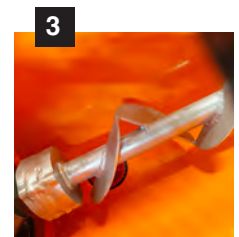
Progressive cavity pumping.

Increase efficiency, profitability and safety on the job.