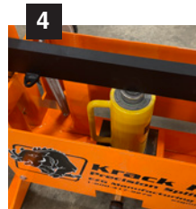
4 High-strength, corrosion resistant hydraulic jack