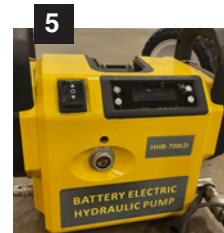
5 Cordless hydraulic pump supplied with two batteries.