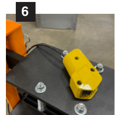
6 Hand-held pendant control for operator safety.