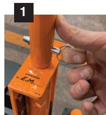
1 Quick release handles.