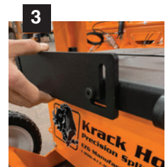
3 Adjustable face plate helps prevent block from falling after split.