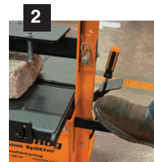
2 Simple pump-action hydraulic foot pedal raises table.