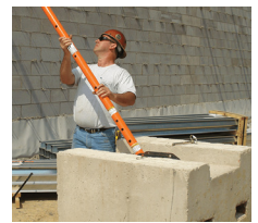
Easy one-man install; anchors to footings without cutting or bolts.