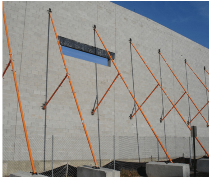
Hog Leg extension kit used with kicker components for increased vertical support.