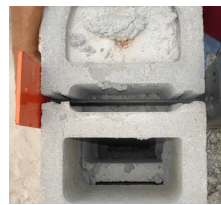
Installs easily through head joint.