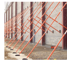
Optional kicker system can be employed for added stability.