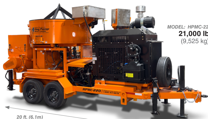
MODEL: HPMC-220 21,000 lb. (9,525 kg)