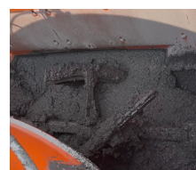
EZG's patented paddle design with 8 blades* ensures uniform clog-free mixing in the remix hopper.