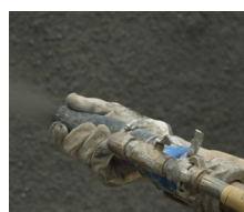
Ultra high-pressure piston pump consistently delivers up to 20 yards* per hour.