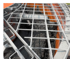
Bag break sits atop a 4000 lb. / 2 yd. pan mixer designed to handle dense refractory shotcrete.