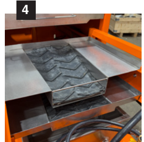
4 Multi-stage water filtration trays that capture sediment and recirculate water.