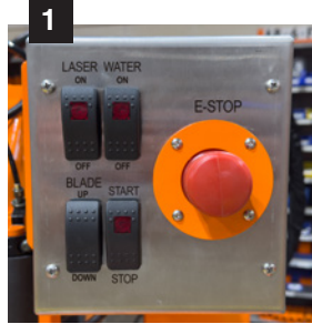
1 Operator control panel provides precise mast lift and laser alignment for accurate cutting.