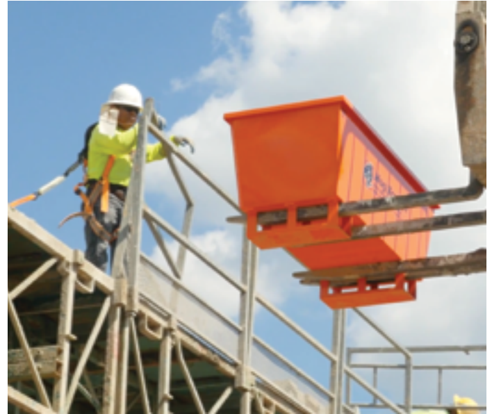
Model HST10 steel tub with forklift utilized for material transport on masonry work site.