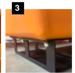
HTP10 comes standard with 10 gauge steel forklift base