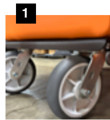
HTPT10W features Heavy-duty smooth surface casters