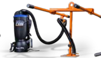
GRIP-HOG-PPV w/ handle kit PP2H