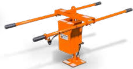
GRIP-HOG-PPB w/ handle kit PP2H