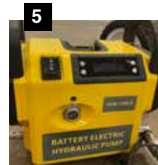
Cordless hydraulic pump supplied with two batteries.