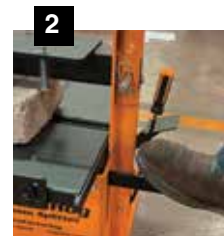
Simple pump-action hydraulic foot pedal raises table.