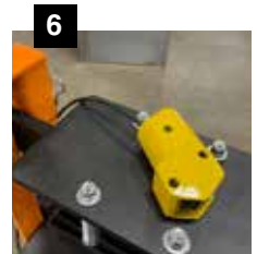
Hand-held pendant control for operator safety.