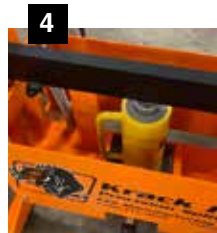
High-strength, corrosion resistant hydraulic jack