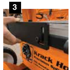
Adjustable face plate helps prevent block from falling after split.