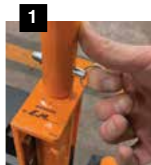
Quick release handles.