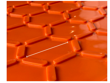
Honeycomb Tread Diameter: 4.25" (108 mm)