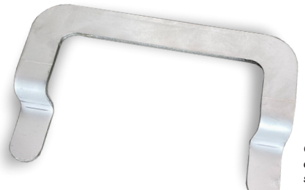
Optional stainless steel connection clamps; item sold separately— GPM-SC