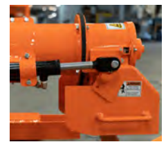
Hydraulic operated release on chute for optimal control of material discharge.