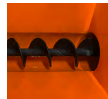
4 7/8" diameter auger is engineered for strength and durability, featuring a standard schedule 80 construction.