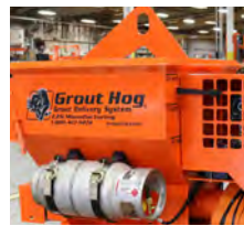
Optional features include crane bail and propane power supply accommodation for auger operation.