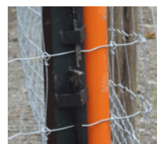
Stretcher bars* (woven-wire bar pictured) help ensure optimal tension and proper alignment of fence during installs.