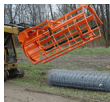
Uniquely designed cage mechanism opens and grapples to retrieve the roll of fence from the ground.