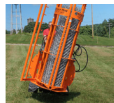
Optional tilt adapter plate permits swivel up to 30° in either direction to assist with installation on rocky or uneven terrain.